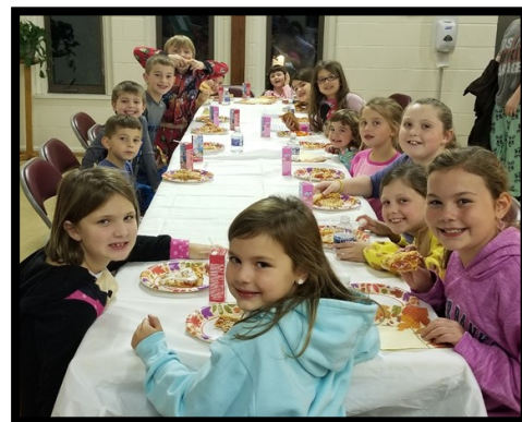
There were 17 at our Movie Night!

You'll be changed forever if you just Believe. Believe in Christmas!