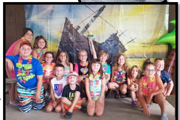
Scenes from our Luau/Water Party